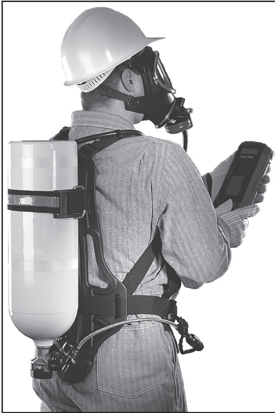
PAS LITE® SCBA PART# 88-0631