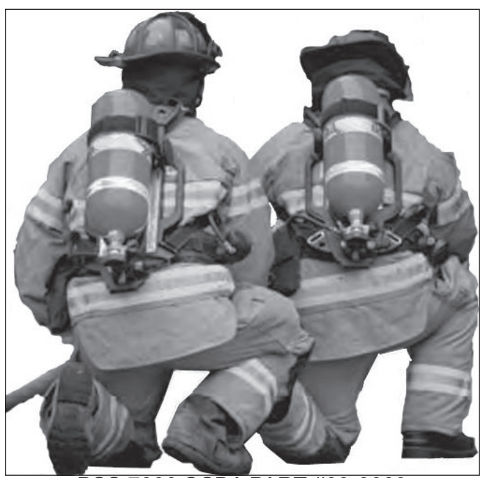
PSS 7000 SCBA PART #88-0663