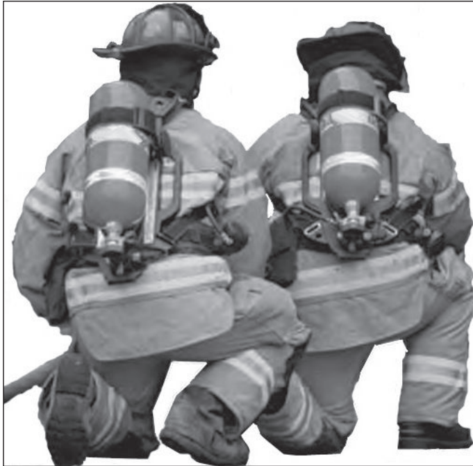
PSS 7000 SCBA PART #88-0667

NIOSH APPROVED 60 MINUTE DURATION PART NUMBER 88-0667