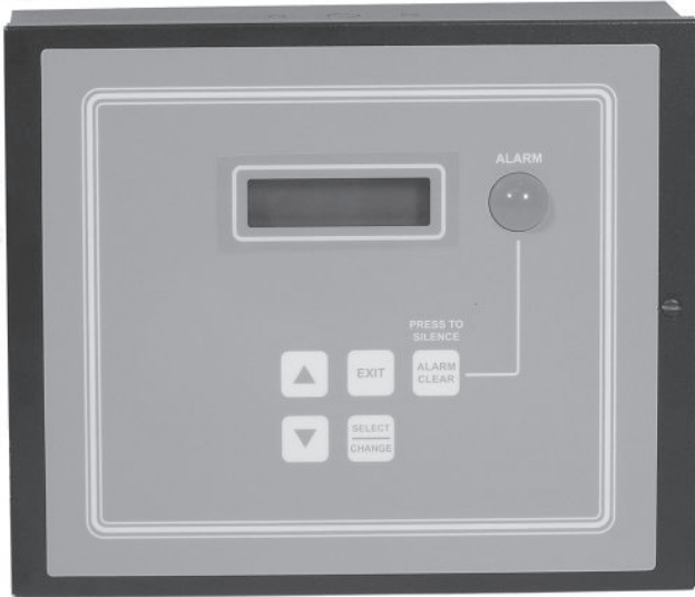
WALK-IN MONITOR (WIM-L)

Kit Part # 88-0324-00 with Room Temperature Sensor