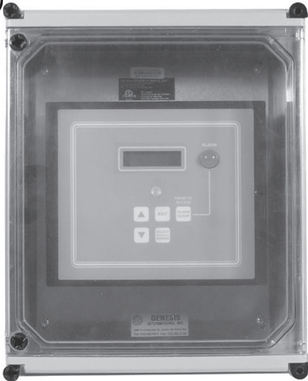
WALK-IN MONITOR w/LEAK DET. (WIM-L-4) Kit Part Number 88-0511-00 with Room Temperature Sensor

The Wizard Single Walk-in Cooler Monitoring System in a NEMA 4X with Leak Detection (WIM-L-4) is an ETL approved monitor and was designed to incorporate most of the functions necessary to monitor the evaporators of a walk-in cooler and freezer of a supermarket, convenience store or restaurant into a compact, simple to install package. The Control utilizes the latest microprocessor technology with two row 16 character LCD back-lighted display. Plain English menu driven user interface is easy to understand and manipulate. It is equipped with a real time clock and a 5 day power loss backup. The control has as standard, an onboard 95db buzzer and a red light that will notify of an alarm. The unit is standard with 6 SPDT system alarm relays (One Silence-able, One Non Silence-able System alarm and four refrigerant leak relays for 2 discrete alarm levels). A single WIM-L-4 System can replace the following items for a complete Walk-In unit: