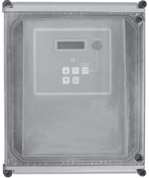
WALK-IN CONTROL 2 ZONE WITH REFRIGERANT LEAK DETECTION NEMA 4X (WIC2-L-4) Part Number 88-0582

The Wizard Dual Zone (WIC2-L) Cooler Control System NEMA 4X with Leak Detection was designed to incorporate most of the control functions necessary to monitor and control the evaporators of a walk-in cooler and freezer of a supermarket, convenience store or restaurant into a compact, simple to install package. The WIC2-L-4 utilizes the latest microprocessor technology with two row 16 character LCD back-lighted display. Plain English menu driven user interface is easy to understand and manipulate. It is equipped with a real time clock with a 5 day power loss backup. The control has as standard, an onboard 95db buzzer and a red light that will notify of an alarm. The unit is standard with 11 SPDT relays. A single control can replace the following items for Two complete Walk-In units: