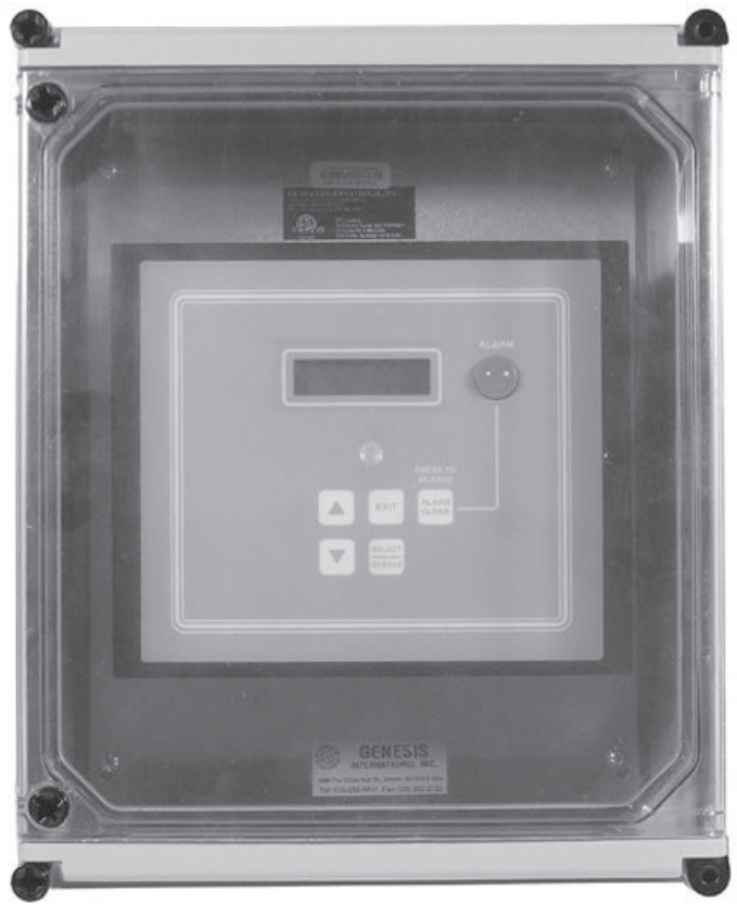
WALK-IN MONITOR (WIM-L-4) Part # 88-0511

The Wizard Single (WIM-L-4) Walk-in Cooler Monitoring System in a NEMA 4X with Leak Detection is an ETL approved monitor and was designed to incorporate most of the functions necessary to monitor the evaporators of a walk-in cooler and freezer of a supermarket, convenience store or restaurant into a compact, simple to install package. The Control utilizes the latest microprocessor technology with two row 16 character LCD back-lighted display. Plain English menu driven user interface is easy to understand and manipulate. It is equipped with a real time clock and a 5 day power loss backup. The control has as standard, an onboard 95db buzzer and a red light that will notify of an alarm. The unit is standard with 6 SPDT system alarm relays (One Silence-able, One Non Silence-able System alarm and four refrigerant leak relays for 2 discrete alarm levels). A single Wizard Walk-in Monitoring System can replace the following items for a complete Walk-In unit: