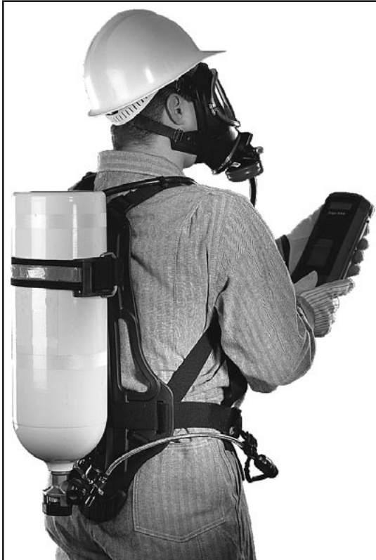
PROAIR SCBA PT# 88-0240