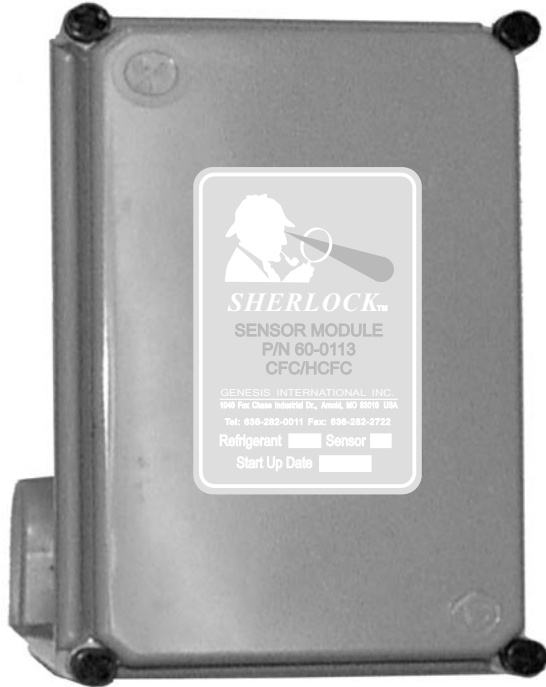
SHERLOCK NEMA 3R CMOS SENSOR