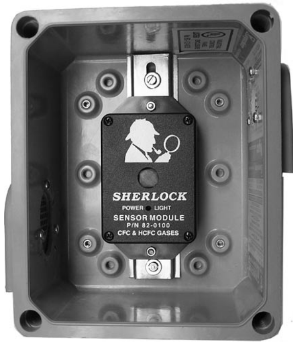
CMOS SENSOR MOUNTED IN HOUSING